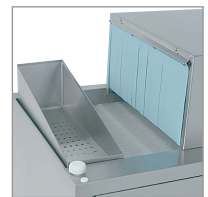
Waste Collector SW47