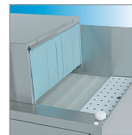
Optional Splash Guard SW12 (for SW400) SW24 (for SW600)